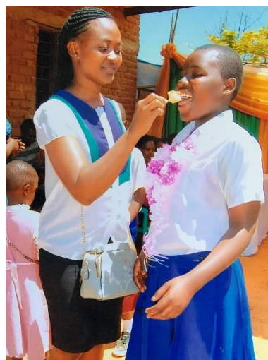
IOP center girls on their graduation day