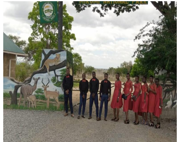
Left photo: Teachers and students at Mikumi National Park gate.

If you would like more information about projects and/or sponsoring opportunities, Please contact: