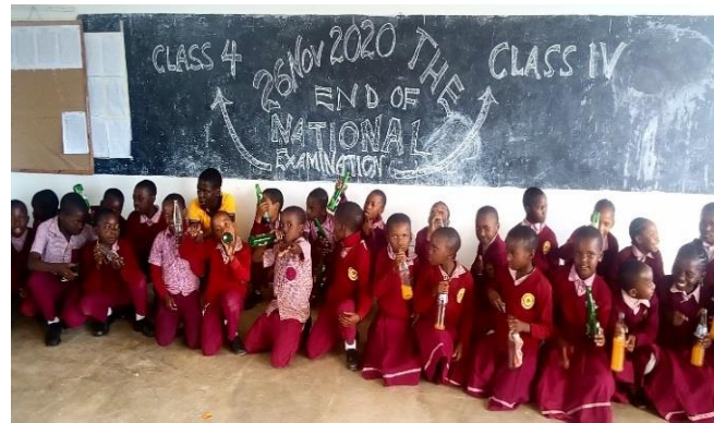
Class IV pupils enjoying after the examinations

The feedback from invigilators said that they have enjoyed the environment, pupils discipline during and after each exam. The school expects that all students will pass the examination because they were well prepared for it.